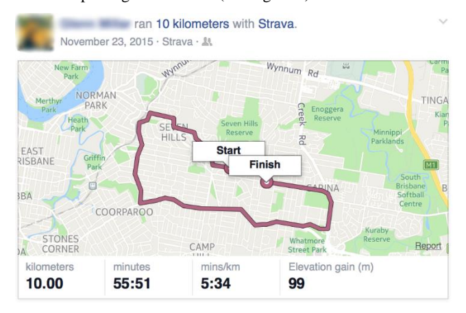
Figure 1. Post showing activity report from a tracking app.

The features that were considered for analysis are described below, based on the type of content presentation which, according to Hypothesis A carries significance.