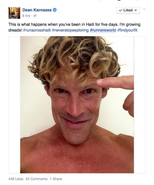
Figure 2. Related post from a world famous runner.